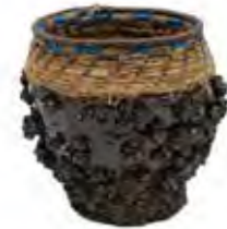
Long leaf pine needle gourd Alice Sior | $39