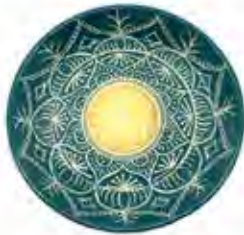
Mandala plate Vicki Sporik | $35