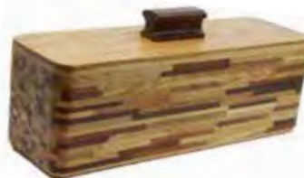
Wooden nesting box Kinney Farris | $45