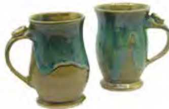
Drip mugs Stephen Cusick | $22