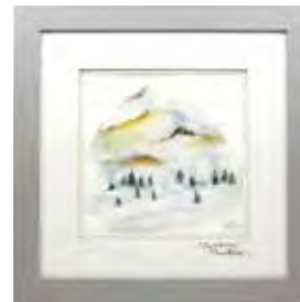
Lonely Spaces Watercolor Bonnie Lorey | $200