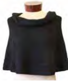
Caplet Knitting, Birgit Hoppenjans | $55