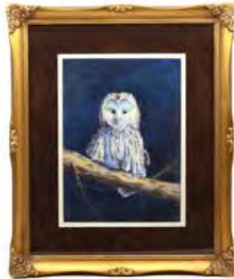
Into the Night (Barred Owl) Watercolor Debra Tritt Kreiger | $400