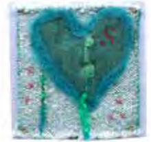
True Mixed media Deborah Fingerlow | $65