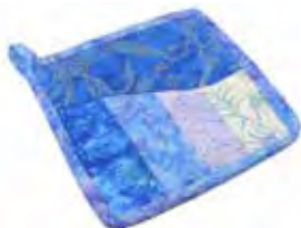
Quilted batik pot holder Ginny Streckewald | $5