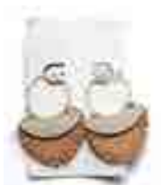
Upcycled leather fan earrings