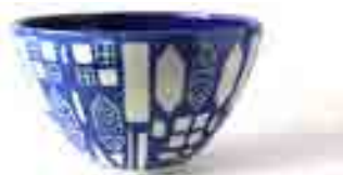
Blue sgraffito bowl