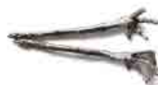
Chicken/Duck Salad Set