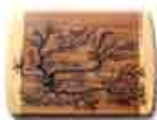
Lichtenberg-style cutting board