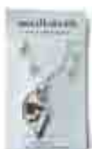
Culinary Classics oregano necklace