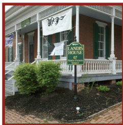
Landis House 67 N. Fourth St., Newport