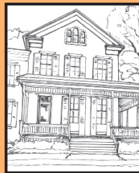
Landis House 67 N. Fourth St., Newport