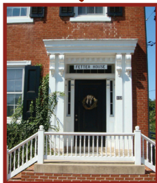
Fetter House 102 S. Carlisle St., Landisburg