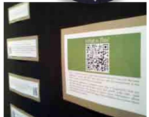
QR Codes in the display at the Sustainable Art exhibit at Landis House.